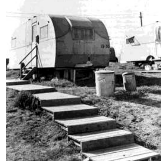
Figure 16. Trailer with Wooden Steps to Avoid Mud (Westcott, 1943)

Yes, we know it's muddy.... You think prices are too high in the grocery store.... Coal has not been delivered.... It takes six days to get your laundry.... The grocer runs out of milk and butter.... The post office is too small.... There are not enough bowling alleys... Your house leaks.... Everyone is not courteous.... It takes too long to get your passes ... The telephones are always busy.... You can't get all the meat you want.... Your house isn't ready.... There's confusion in the cafeteria.... The dance hall is crowded .... There's no soda fountain.... The guest house is full.... Employees are inexperienced.... You don't like the way things are run.... Things were different 'back home'.... You could do better.... You would have planned it differently. (Robinson, 1950, 54-55)