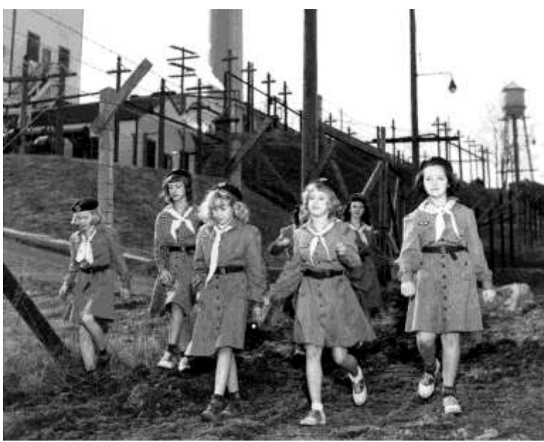
Figure 2. Girl Scouts near Reactor, Oak Ridge (Westcott, 1951)

Picturing the Bomb: Photographs from the Secret World of the Manhattan Project (Fermi, Rhodes, & Samra, 1995) includes forty-three Westcott photographs, a Westcott cover photo, and some biographical text. Fermi interviewed Westcott for the book, which contains photographs of all three Manhattan District sites, as well as Tinnian Island (air base for the Enola Gay), the Enola Gay and crew, and shots of the Hiroshima and Nagasaki explosions and aftermath.