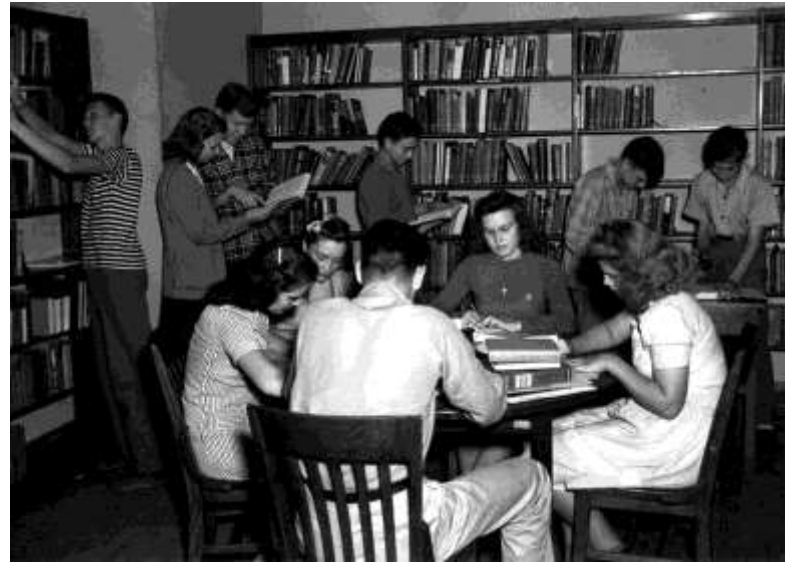
Figure 14. High School Library, Oak Ridge (Westcott, c. 1944)