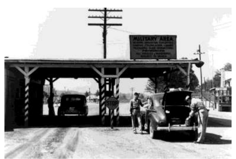
Figure 4. Perimeter Security Gate, Oak Ridge (Westcott, 1942)

Westcott was required to photograph exterior shots of every building at the CEW plant sites and interior shots of equipment and workers (Figure 5) unless the equipment was deemed too sensitive by Army Intelligence. One interesting shot depicts a group of young women operating the control panels in the Y-12 electromagnetic plant (Figure 6). These young women were trained to do a very specific job, without knowing they were producing uranium-235.