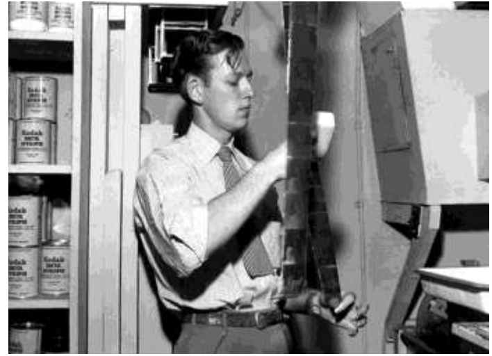
Figure 13. Ed Westcott, Oak Ridge Photo Lab (Westcott, 1945)