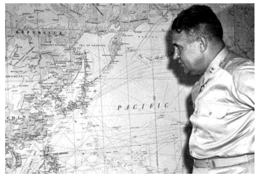
Figure 11. General Groves, Washington, D.C. Office (Westcott, 1945)