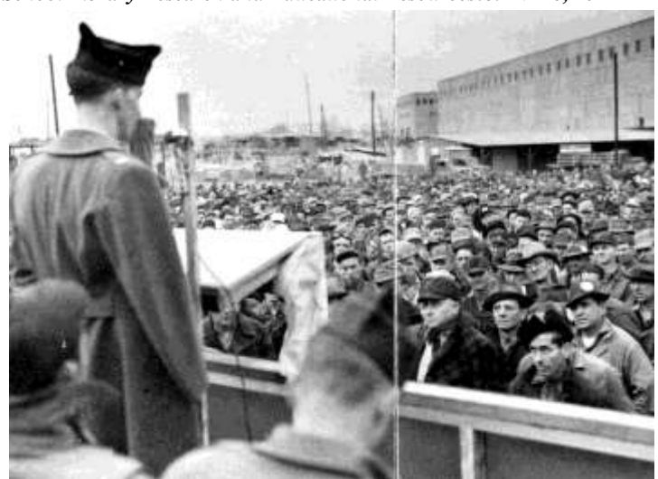
Figure 12. War Bond Rally, K-25 Plant (Westcott, c. 1944)

Another of his official photographic duties included developing prints from the classified negatives of other photographers, and in this capacity, he was the first person to view the classified military photographs of the destruction of Hiroshima and Nagasaki after the atomic bombs were dropped. When asked if he was shocked by the photos, and he replied, 'Yes, of course ... the destruction was terrible' (1999).