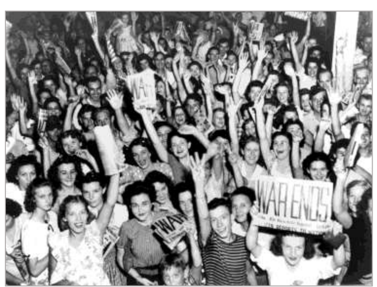
Figure 1. WAR ENDS (Westcott, 1945)

The special fiftieth anniversary 1992 issue of the Oak Ridge National Laboratory Review (Krause) credits the cover photo, the famous WAR ENDS image (Figure 1), to Westcott, but does not credit him with the other numerous photos within the text. Three notable monographs that feature his uncredited photographs are Now It Can Be Told: The Story of the Manhattan Project (Groves, 1962), The First Nuclear Era: The Life and Times of a Technological Fixer (Weinberg, 1994), The Making of the Atomic Bomb (Rhodes, 1986), Oak Ridge National Laboratory: First Fifty Years (Johnson & Schaffer, 1994), and City Behind a Fence: Oak Ridge, Tennessee 1942-1946 (Johnson & Jackson, 1981). The latter's cover image of girl scouts walking near the X-10 nuclear reactor was taken post-WWII, in 1951 (Figure 2). According to Westcott (1998), girl scouts would never have been allowed this close to the graphite reactor during the war years.