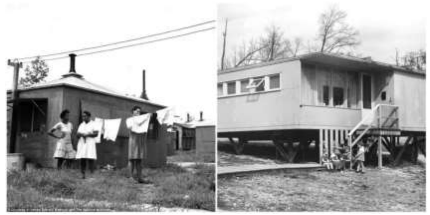
Figure 18. Housing for 'Colored' Family, 'White' Family (Westcott, 1940s)

We stcott's images document the segregation that existed in the 1940's – separate housing (Figure 18), schools, social events (Figure 19), even workers' outhouses (Figure 20).