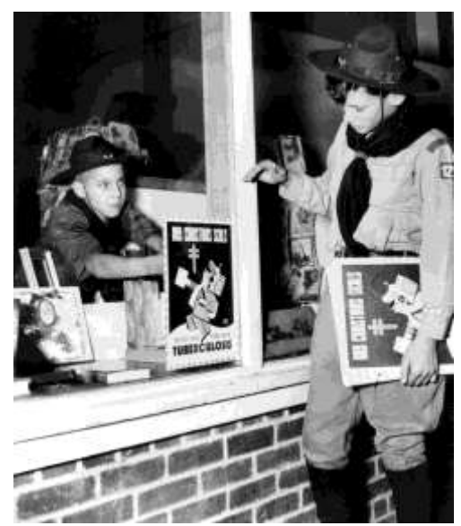
Figure 23. Boy Scouts with Christmas Seal Posters (Westcott, c. 1944)