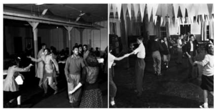
Figure 19. 'Colored' Teen Dance, 'White' Teen Dance (Westcott, 1940s)