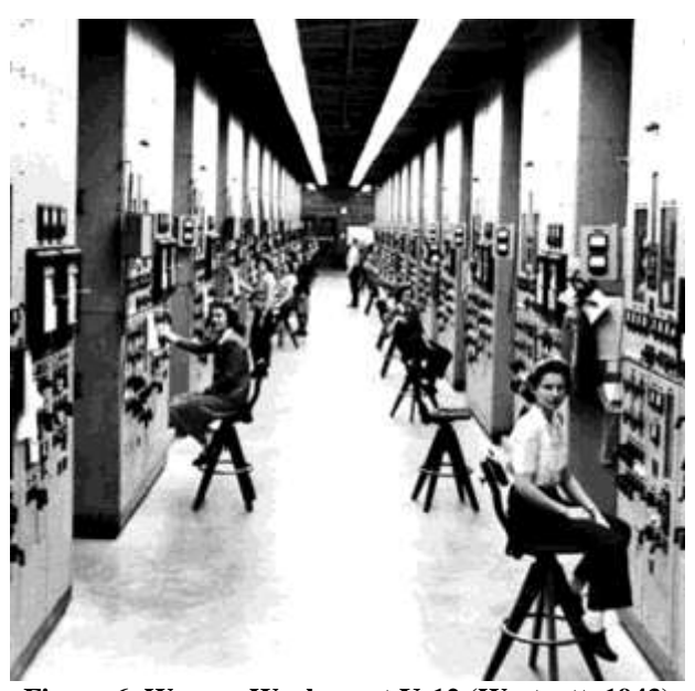
Figure 6. Women Workers at Y-12 (Westcott, 1943)