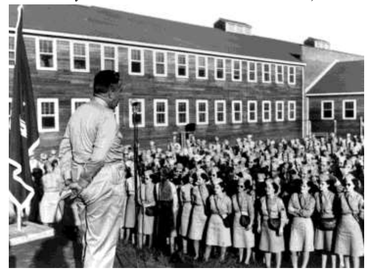
Figure 10. General Groves Addressing WACs (Westcott, c. 1943)

One of the most famous Westcott photograph of Groves is the July 1945 shot of General Groves looking at the map of Japan (Figure 11). Westcott was summoned to the Washington, D.C. office of General Groves for a series of photographs. In an interview in Popular Photography , he recounted, 'I arrived in Washington two days after General Groves witnessed the test in New Mexico, and of course I didn't know anything about it.