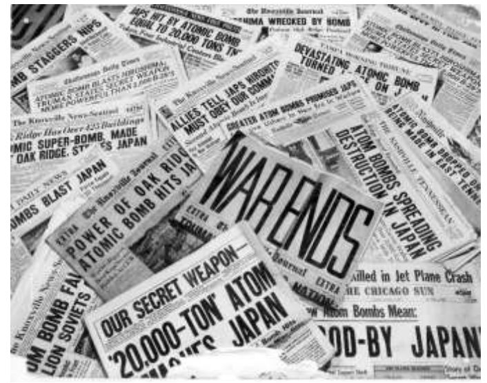
Figure 29. Newspaper Montage (Westcott, 1945)

Warner Ogden (1946) said of him, 'Since he was the only photographer in Oak Ridge, and since outside commercial photographers were not allowed to bring cameras into the area during the war, Westcott had a varied pattern of jobs. He was not only the news cameraman, but the official photographer for the Oak Ridge High School year book, a publicity photographer for special events and bond drives, a free-lance man for private enterprises, and the portraitist for the entire community'. Ogden noted that 'close to 80,000 pictures have been taken in the now world-famous town of Oak Ridge by this quiet, drawling, hardworking bundle of atomic energy' (160).