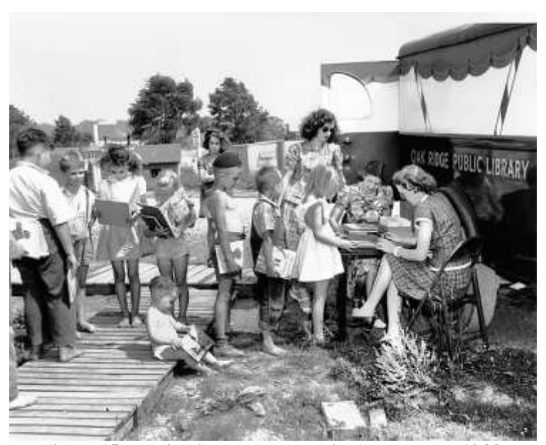
Figure 15. Public Library Bookmobile (Westcott, c. 1944)

Westcott's photographs of long lines at the grocery and of cars stuck in the mud are evidence of the frontier conditions that existed in the early years (Figure 16).