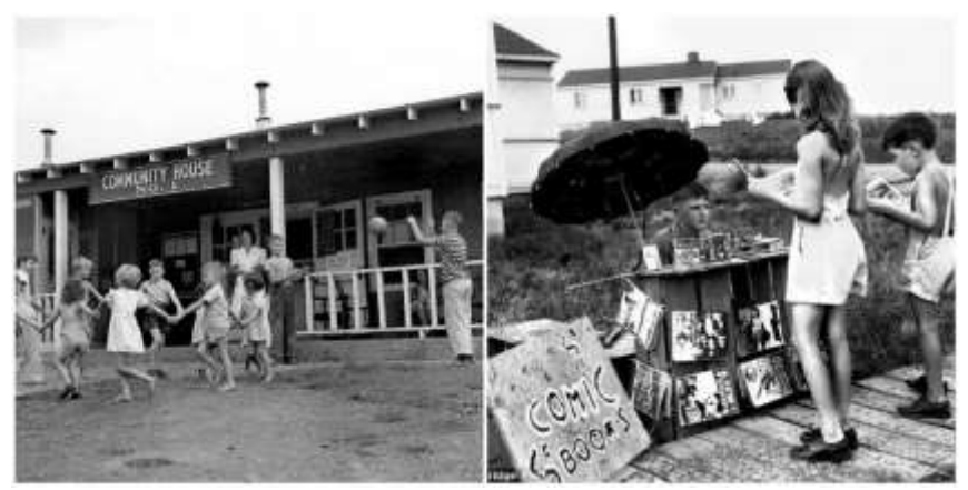
Figure 22. Community House Day-Care, Neighborhood Comic Book Stand (Westcott, c. 1944)