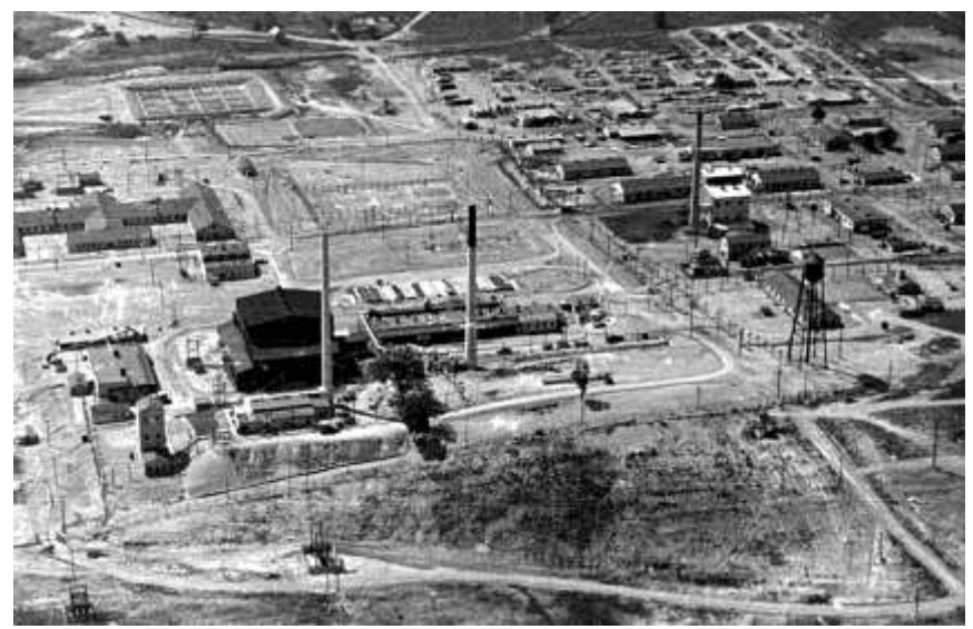
Figure 27. Aerial Photo of X-10 Graphite Reactor (Westcott, 1943) (Note: Westcott noted that you can tell Graphite Reactor images were taken during WWI if roof is painted black for security blackout at night)

designed and had made a 'wind hood' by the CEW metal-workers to fit the Speed Graphic camera for aerials. It was crafted of sixteenth-inch sheet metal with holes at the top and sides to attach to the camera with bolts and wing nuts. A heavier strip of metal was used in bracing the lower part of the hood under the camera. The hood was painted black, and proved to be a good sunshade as well as protection from the wind (Westcott, 1999).