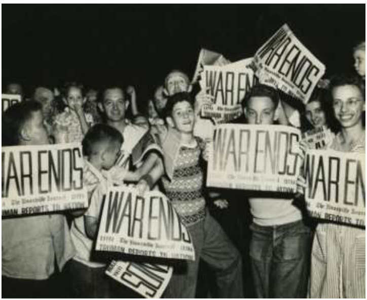
Figure 28. WAR ENDS (Westcott, 1945)

Westcott took another widely-published and historical shot later that evening when he returned home. He gathered as many newspapers as he could find, arranged them on his living room floor, and photographed them as a montage of V-J Day headlines (Figure 29).