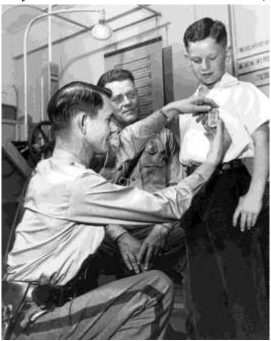
Figure 24. 12-Year Old Boy with First ID Badge (Westcott, c. 1943)