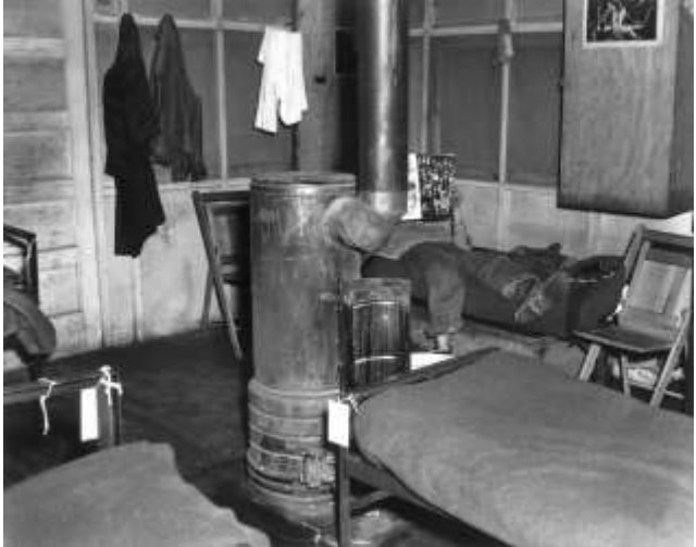
Figure 8. Hutment Interior (Westcott, c. 1943)