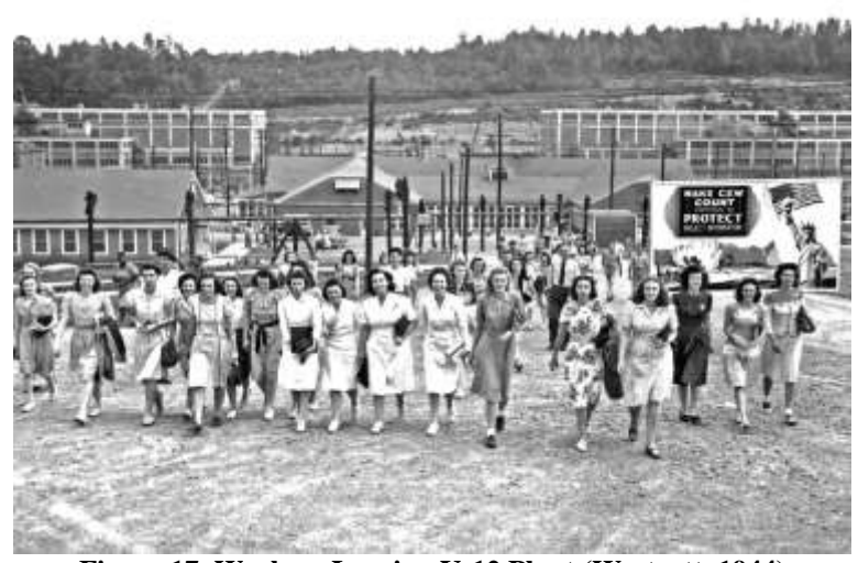
Figure 17. Workers Leaving Y-12 Plant (Westcott, 1944)