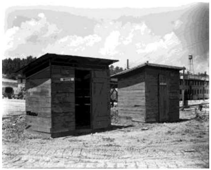
Figure 20. Separate Outhouses (Westcott, c. 1944)