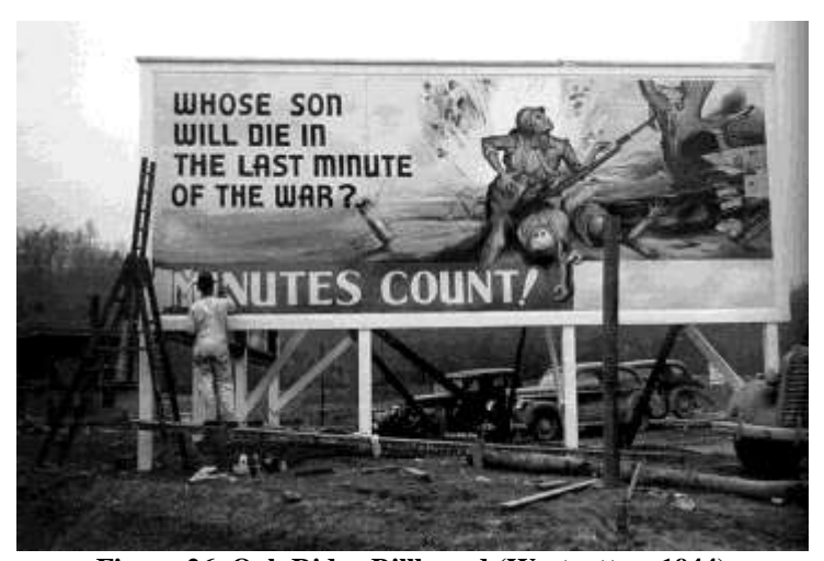
Figure 26. Oak Ridge Billboard (Westcott, c. 1944)

The tight security and patriotism of that era were evidenced by the billboard slogans that appear in many Westcott photos, such as 'Whose Son Will Die in the Last Minute of the War? Minutes Count! (Figure 26), 'If You Believe in Freedom, Work for It', 'What You See Here, What You Do Here, What You Hear Here, When You Leave Here, Let It Stay Here', 'Loose Talk Helps our Enemy', and 'Hold Your Tongue, the Job's Not Done: Silence Still Means Security'. The Oak Ridge Journal 's by-line read 'NOT TO BE TAKEN OR MAILED FROM THE AREA' and as mentioned earlier, every Westcott photograph to be published had to be approved (and sometimes censored) by Army Intelligence (Westcott, 1999).