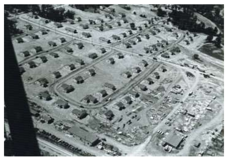
Figure 7. Aerial View of Prefab Houses (Westcott, 1944)

Many Westcott photographs of housing and living conditions at Oak Ridge were used to illustrate the book Dear Margaret: Letters from Oak Ridge (Present, 1980) and a few were used in the book Atomic Spaces (Hales, 1997).