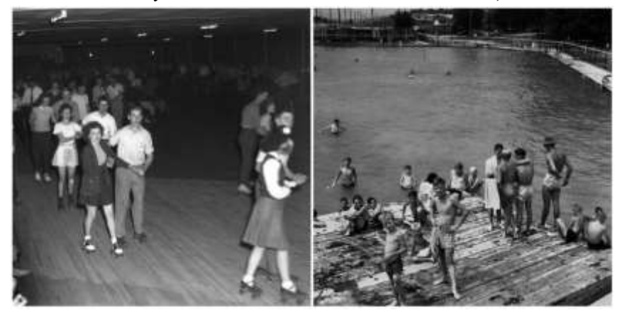
Figure 21. Roller-Skating Rink, Swimming Pool (Westcott, c. 1944)