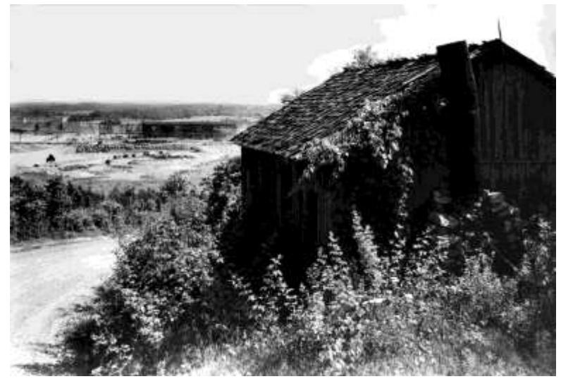
Figure 3. Cabin with Construction in Background (Westcott, 1942)