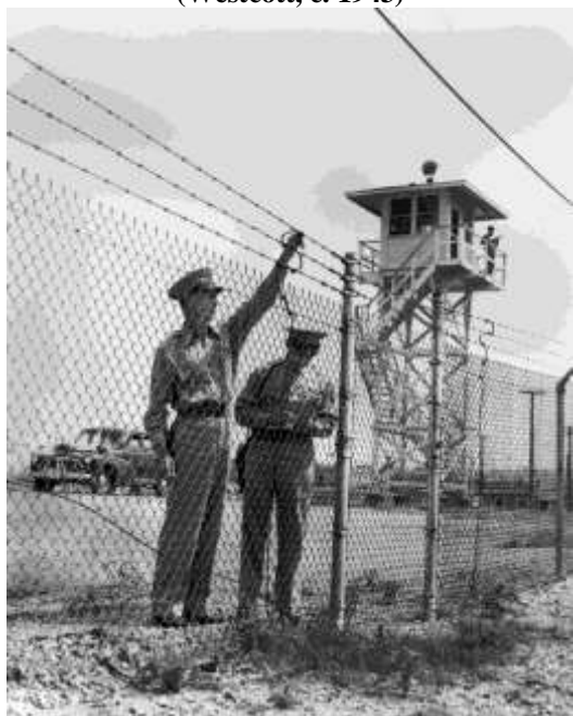
Figure 25. Security Fence and Guard Patrols (Westcott, c. 1943)