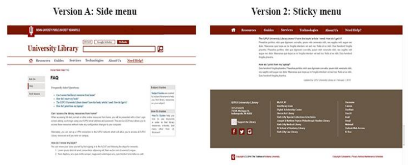
Figure 1 A/B methods

the library website effectively (Lee, 2014a). The DUX Working Group developed the standard template applied to all UL pages aligned with Indiana University design requirements. The Group took readability into consideration as the user survey revealed that users had difficulty finding key information on the web page. This led the Group to develop two-column layout so key information is highlighted in the right side. Moreover, the Group used A/B testing to compare different versions of prototypes for menu location on the page – sticky menu vs. left-side menu vs. breadcrumbs – to see which one users prefer. In order to implement the best design in the real production environment, the DUX Working Group iterated the design process from low-fidelity wireframe to high-fidelity prototype based on informal user feedback.